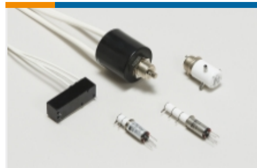
High Voltage Relays(13)