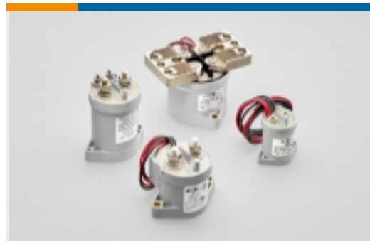
General Purpose Contactors(4)