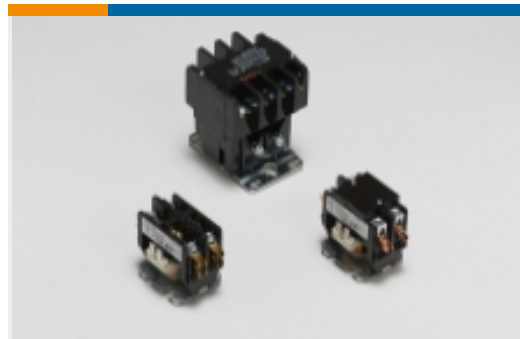
Definite Purpose Contactors(1)